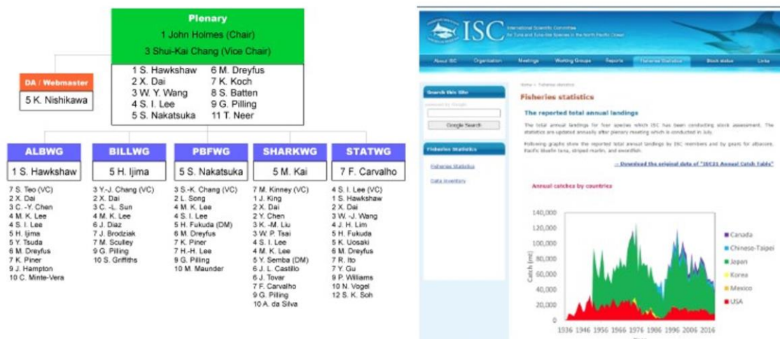
Figure 2. Regular updates to the ISC website as of July 2022.