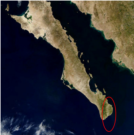
Fig 1. Primary area of recreational fishing operations in the western coast of the Gulf of California.

Billfish are very highly regarded as prize fish by sport fishermen, and international tournaments are held every year, with marlin and sailfish being the most targeted species. Striped marlin, blue marlin and sailfish make up 99% of billfish captures, which total to around 23,000 fish a year 2 . Billfish are exclusively reserved for recreational fishermen, but due to bycatch in the commercial fisheries, these two sectors in Baja California Sur have been in conflict over billfish resources.